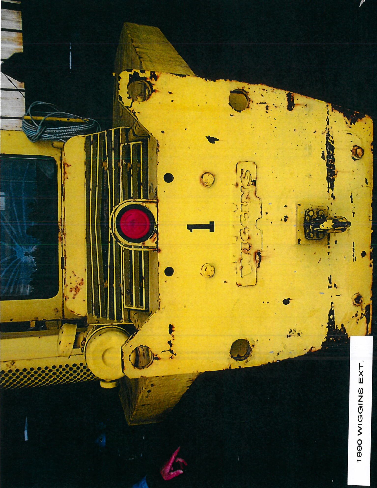
1990 WIGGINS EXT.