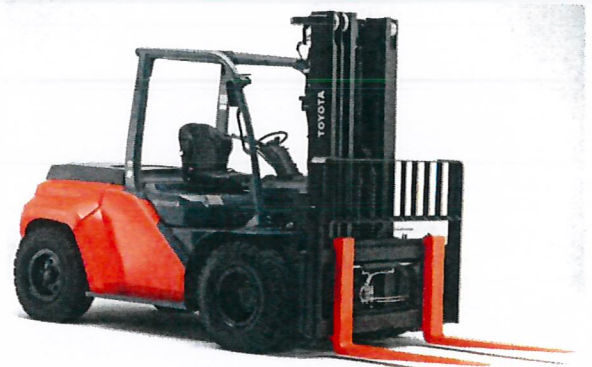
Models 8FD70U Shown

Your Toyota lift truck is outfitted with a rugged planetary drive axle. This planetary drive axle decreases the torsional stresses commonly experienced with power shifting, resulting in greater durability, reliability, which results in