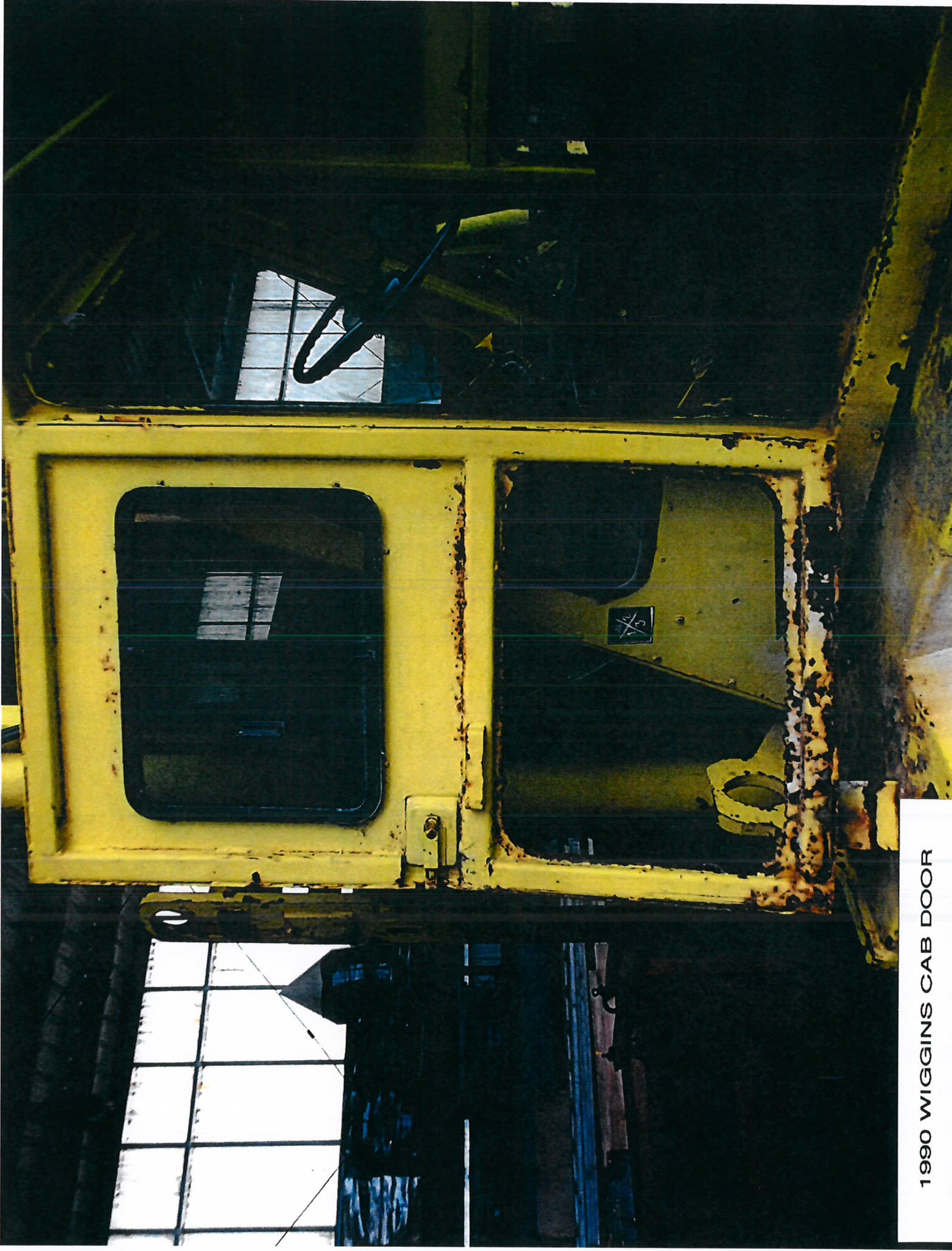
1990 WIGGINS CAB DOOR