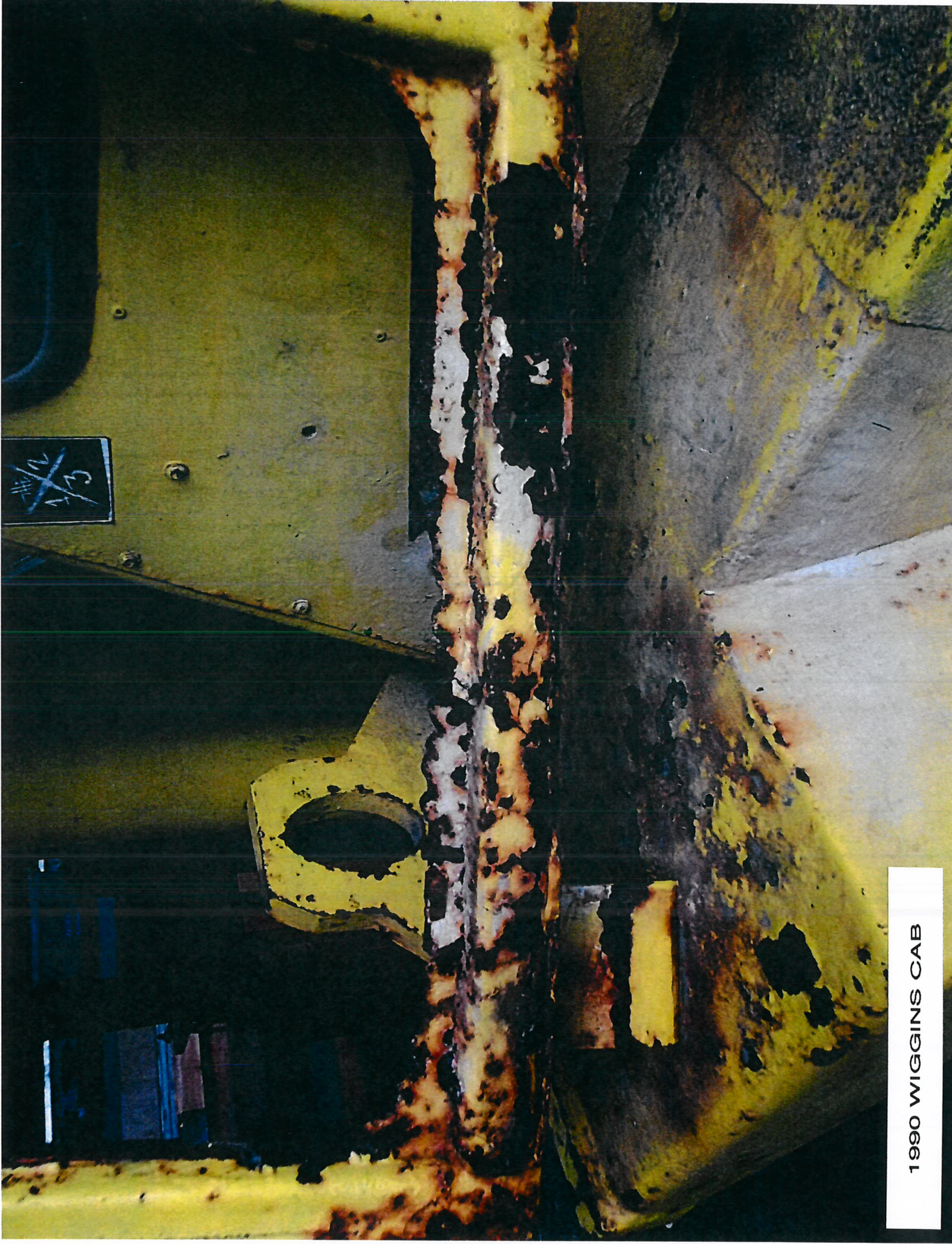
1990 WIGGINS CAB