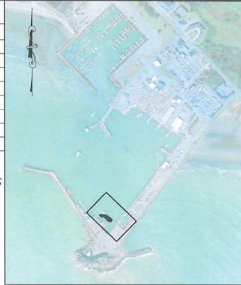
KEY MAP NTS