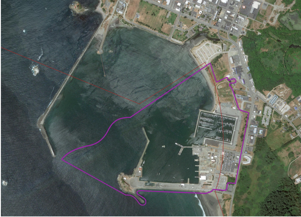
Project Area Map (Figure 2)