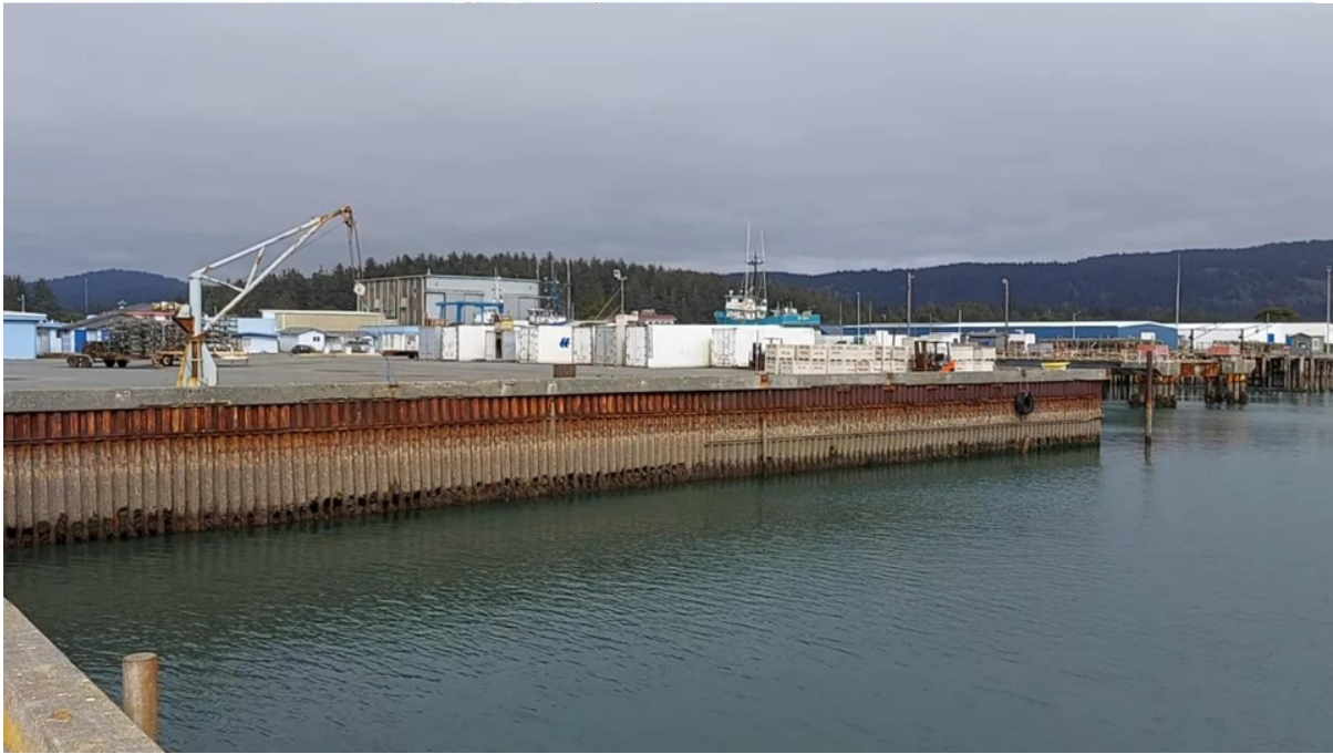
Long shot of entire Seawall (Figure 4)